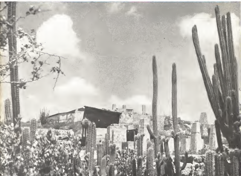
Remains of the gold mine at Spanish Lagoon.

Printers: Verenigde Antilliaanse Drukkerijen VOL. 1, No. 4 SEPTEMBER 1966